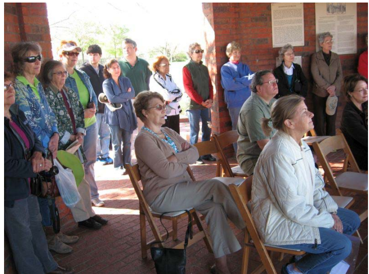
Members and guests enjoying the program