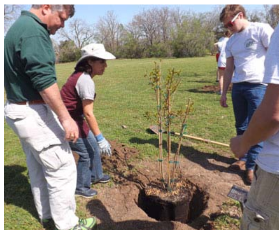
Planting a crape Myrtle in memory of our 3 Garden Club Members