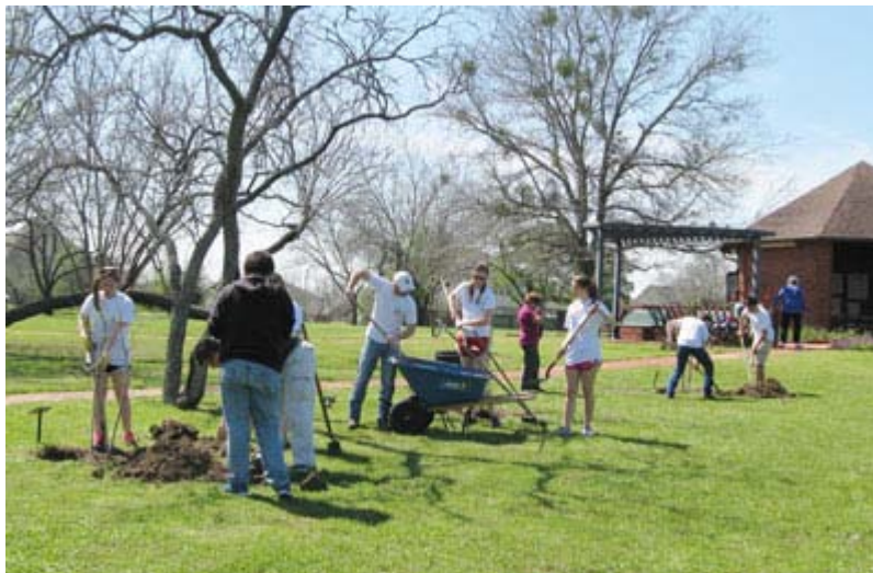
The Big Event Student Volunteers digging the 3 holes