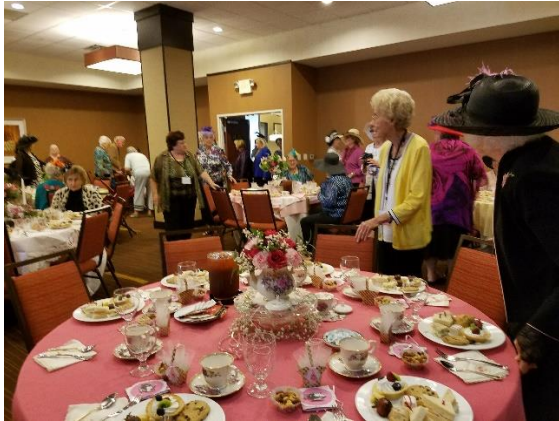
The Afternoon Tea