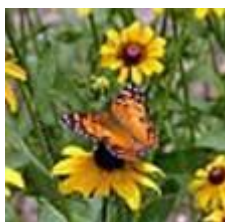
Painted Lady on Black-eyed Susan

Black-eyed Susan Plumbago Goldenrod Pipe-vine Passion-vine Sedum Sunflower Hollyhock Coneflower Lantana