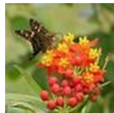
Long-tailed Skipper on Milkweed

Milkweed Larkspur Yarrow Senna Hackberry Willow tree