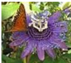
Fritillary on Passion-vine

Gulf Fritillary Swallowtails Snouts Admiral Queen Skippers