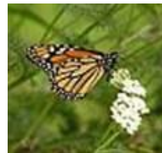
Monarch on Yarrow

Monarch Sulphurs Tawny Emperor Hairstreaks Buckeye Painted Lady