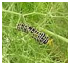
Black Swallowtail on Fennel

Fennel Dill Parsley Verbena Salvia greggi