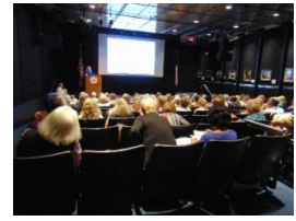
Filling the Auditorium