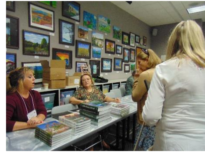
Book Sales Table