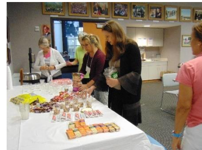
Volunteers preparing the snack table for the first break.