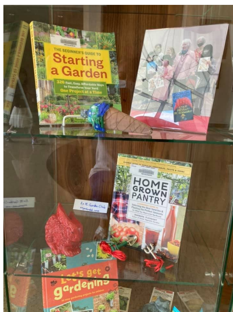
Close up of the display case in College Station!