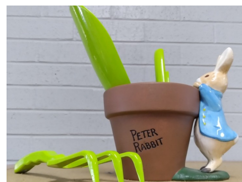
Cute Peter Rabbit figurine!