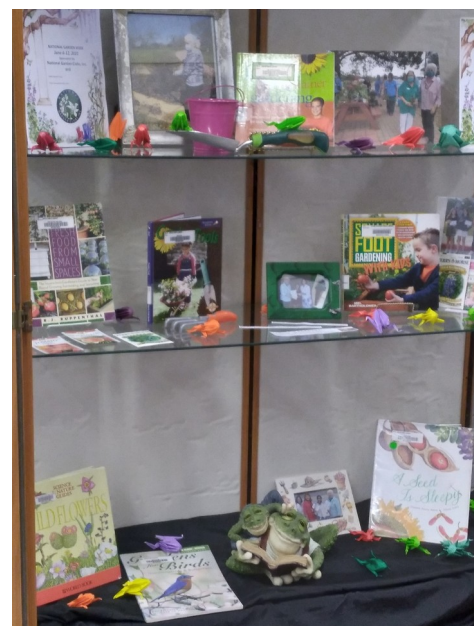
Display Case at Clara B Mounce Library in Bryan, Texas.