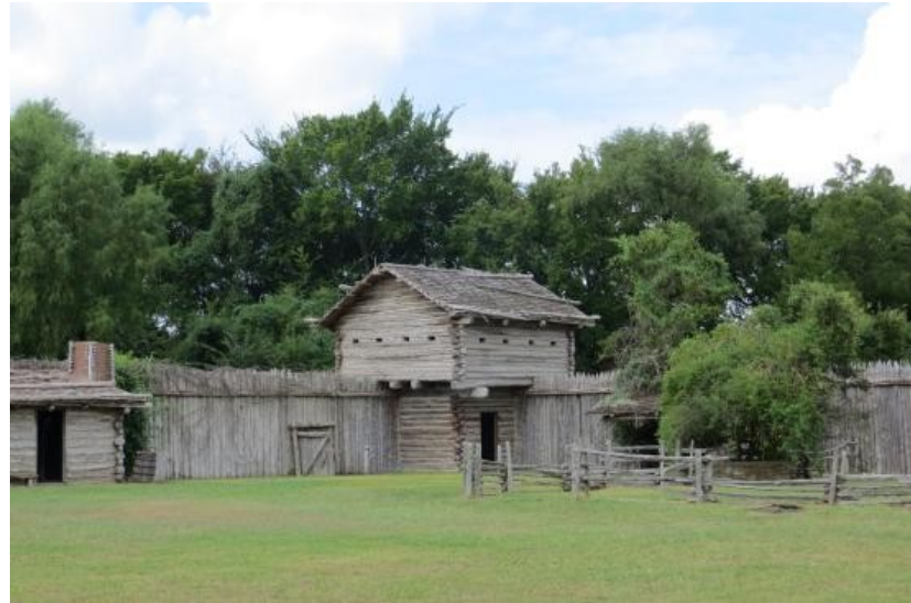
Old Fort Parker https://tinyurl.com/57uepk6f