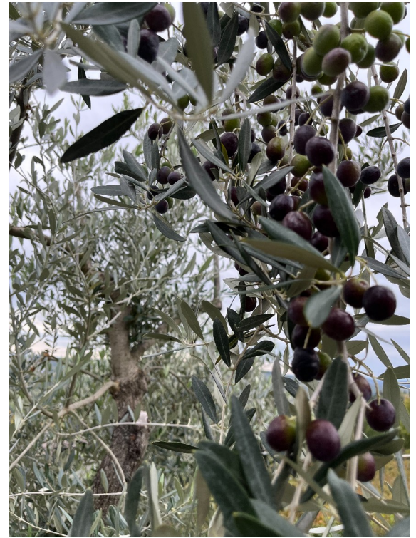
Ripe Olives ready for Pressing in Tuscany