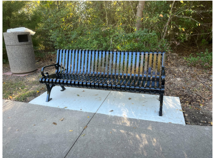
Park Bench donated for seating across from the Never Forget Garden