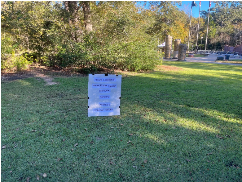
Site of the Proposed Never Forget Garden