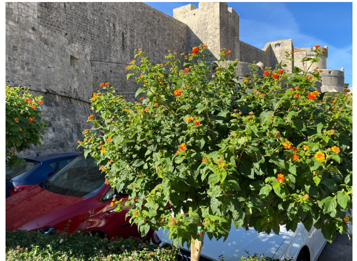
Huge Lantana “trees” in Tuscany - yep those are cars next to it