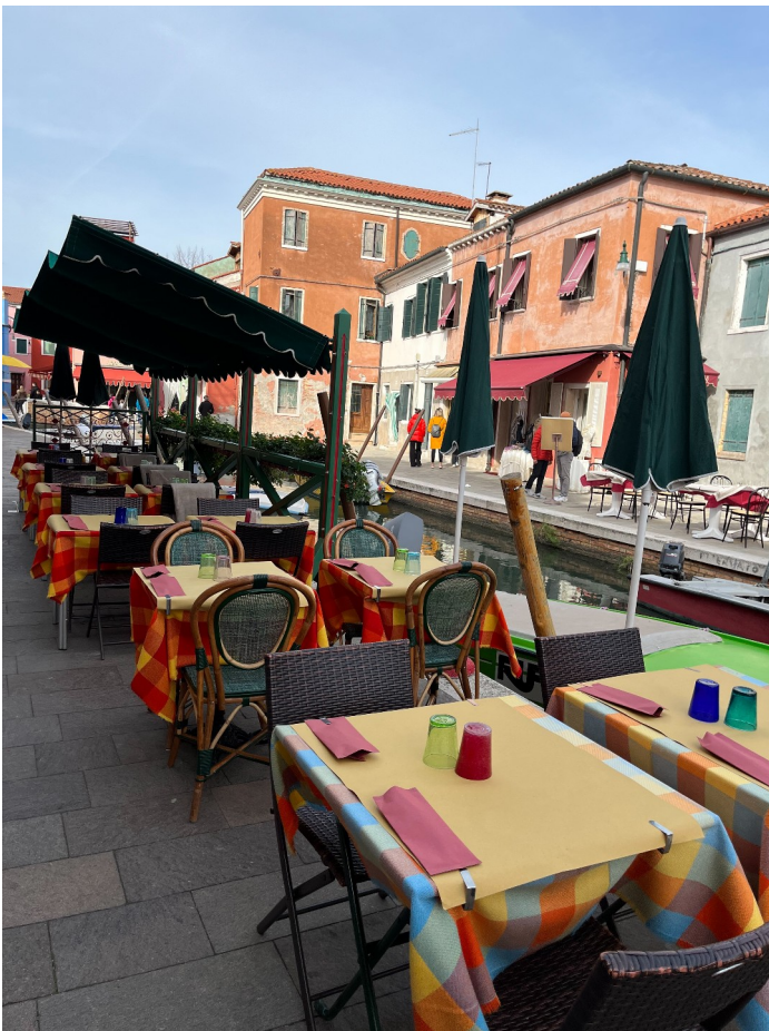
Burano is know for its colorful houses - I loved the table “design” aspect of bringing color to the sidewalk cafe