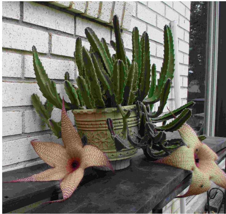
Two blooms (top)