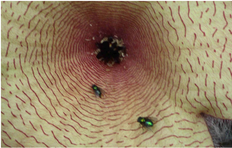
Blow flies (left)