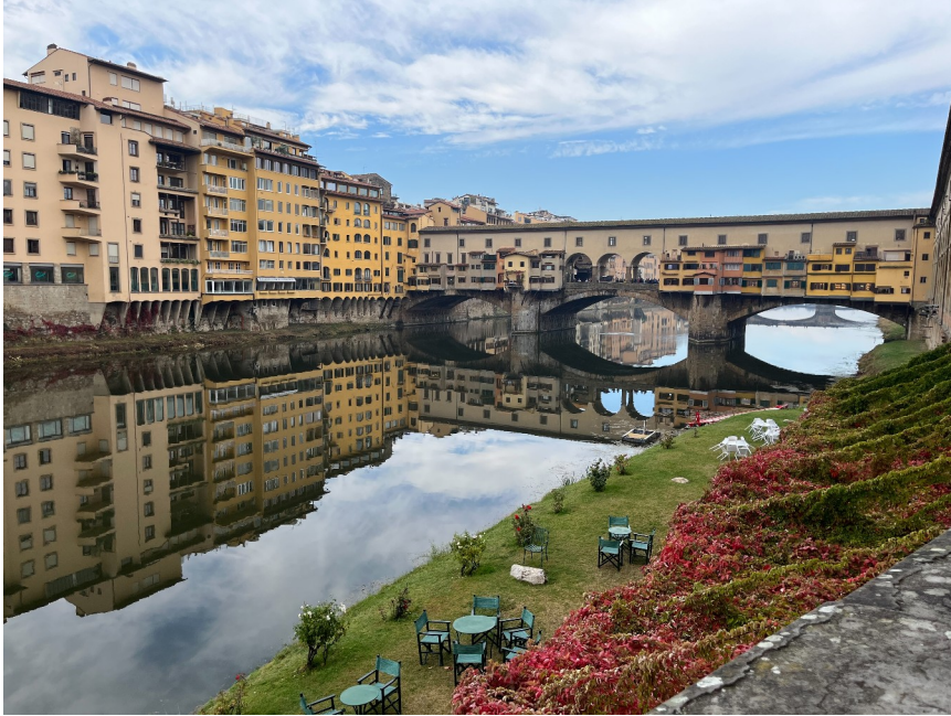
The Oldest Bridge in Florence - check out that colorful landscape!

From Heather White: I had the joy of going to the Mediterranean for 3 weeks.