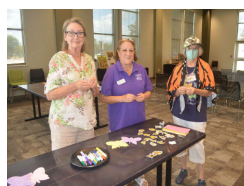
One Craft Table