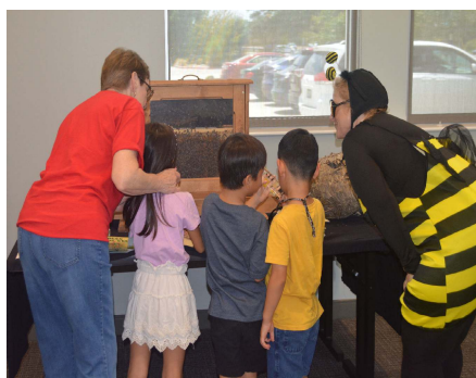
BeeWeaver Honey Farm Exhibit