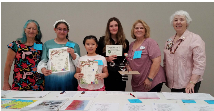
Several of the six NGC Youth Award winners and families joined us for dessert. Also had eight 1 st at SCR. Yay!!!