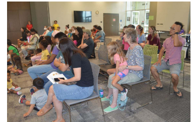
Parents and Grandparents