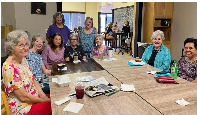
Aug 26 Gogh-Gogh Coffee, Eleven attended.