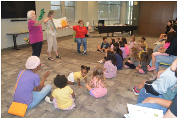
The Hungry Caterpillar