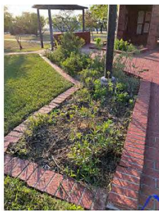
Bed before weeding/pruning