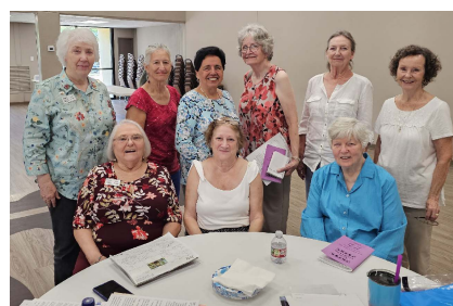
A&M Garden Club Board met on Aug 4.

National Garden Clubs, Inc. provides education, resources, and national networking opportunities for its members to promote the love of gardening, floral design, civic and environmental responsibility.