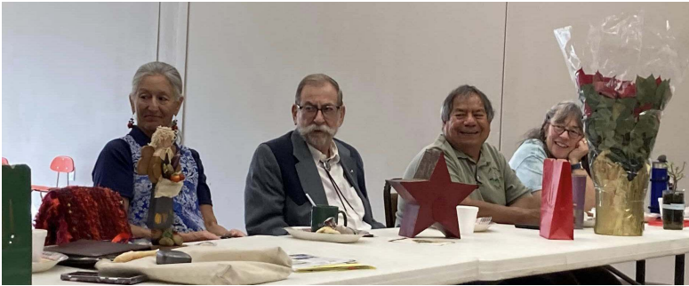
Food Pot Luck Dishes