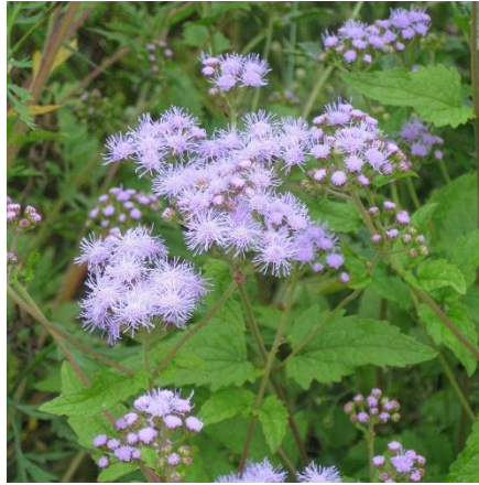
GREGG'S BLUE MISTFLOWER

VEGETABLES: Sow radishes, southern peas, summer squash, snap beans, dry beans, sweet corn, cucumber, okra, watermelon, cantaloupes and New Zealand spinach. Start tomato plants for second crop.